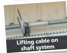
Lifting cable on shaft system