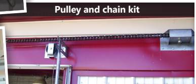
Pulley and chain kit