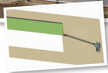
SINGLE ROLL-UP CURTAIN ▶