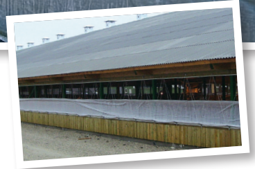
FIXED OR REMOVABLE SINGLE CURTAIN ►