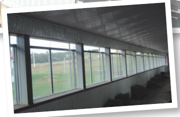
LEXAN CLEAR PANEL ►